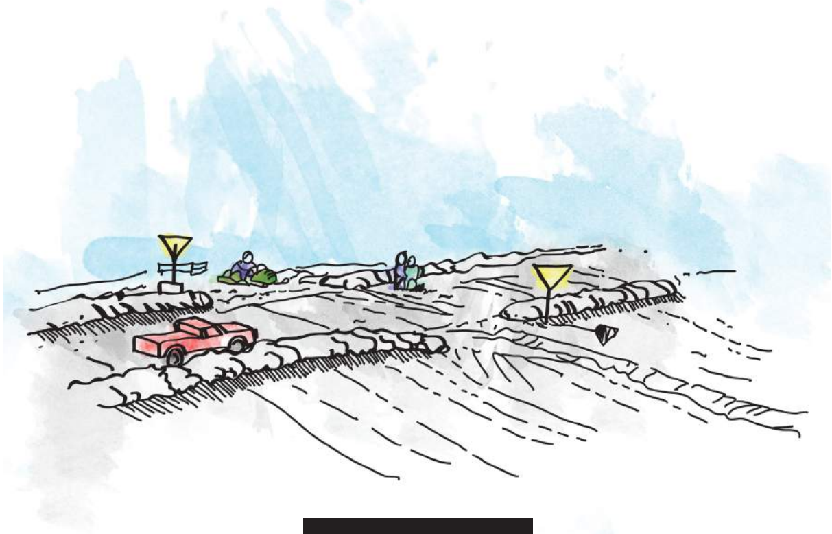
Figure 8: Snowmobile Cross